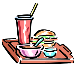
Eat Softer. Cook less often.

Eat softer. Cook less often. Easy recipe stews, homemade vegetable soups, casseroles and pasta can be prepared, stored in air tight containers and reheated quickly. For a warm summer, a cool choice like gazpacho can be prepared for consumption and frozen, are easy to serve and to swallow. All of these types of foods can be adjusted for the desired consistency (for chewing & swallowing) without losing their appeal.