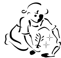
I can still participate...

So what if I spend the majority of my limited time outside mostly prostrate on the ground, sometimes trying to make sense of what I see and manipulating my lower limbs so that I can have